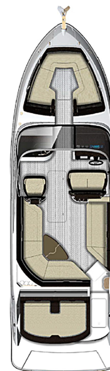
Standard Seating Plan

Aluminum Tandem Axle w/ Bunks & Dual-Axle Disc Brakes Galvanized Tandem Axle w/ Bunks & Dual-Axle Disc Brakes Painted Tandem Axle w/ Bunks & Dual-Axle Disc Brakes