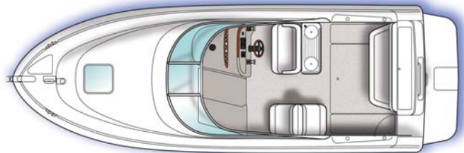
Cockpit Layout w/Standard Seating