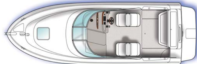
Cockpit w/Optional Seating Layout