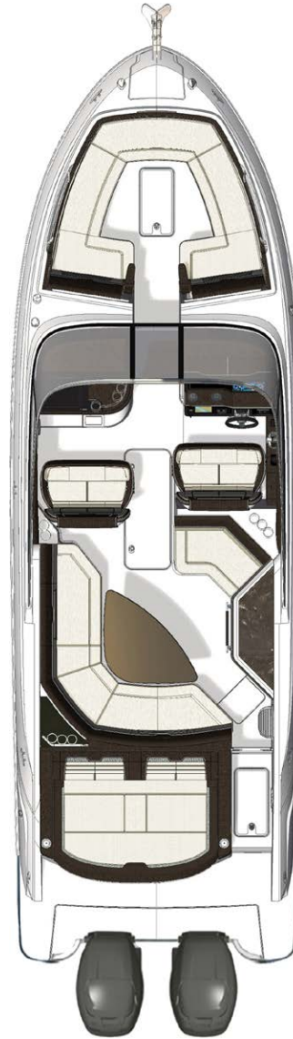
STANDARD SEATING PLAN