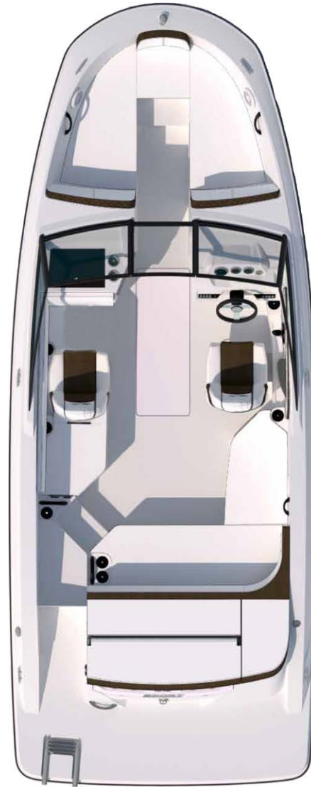
STANDARD PORT BUCKET SEAT