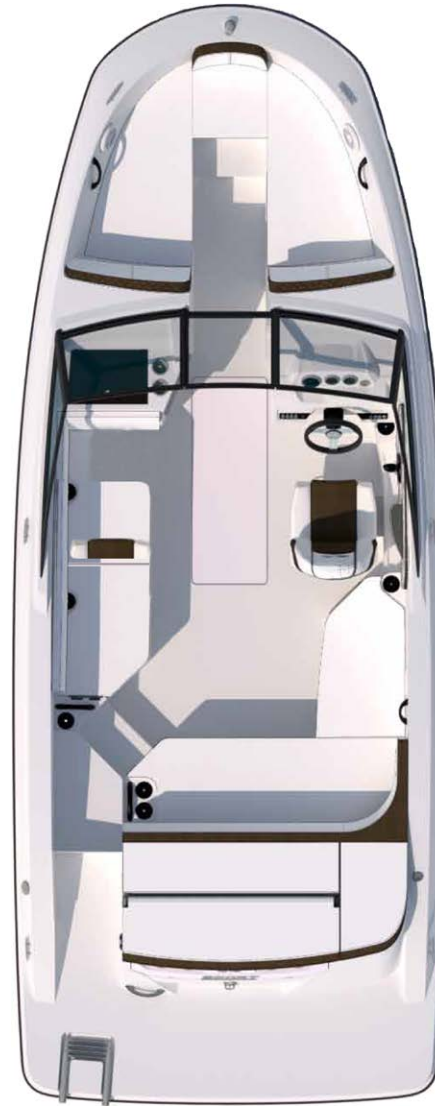
OPTIONAL PORT LOUNGER with convertible backrest