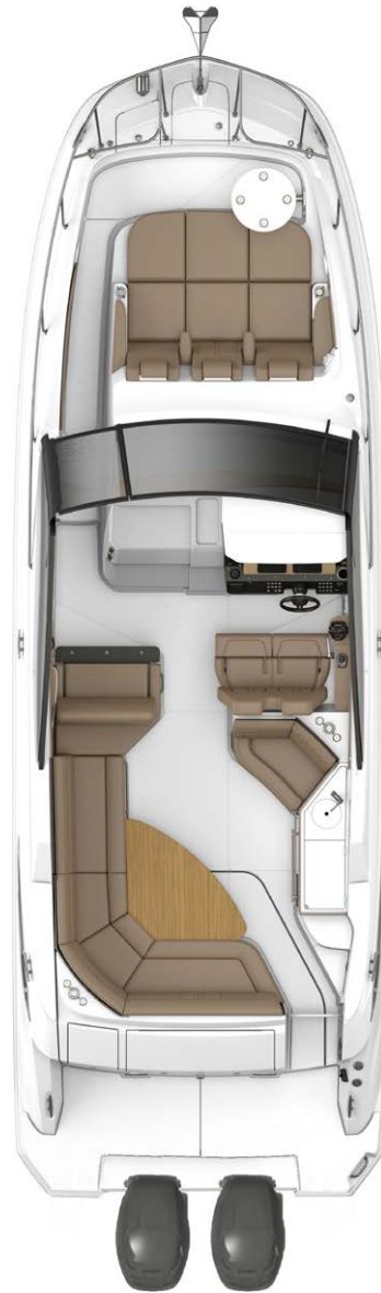
DECK / COCKPIT