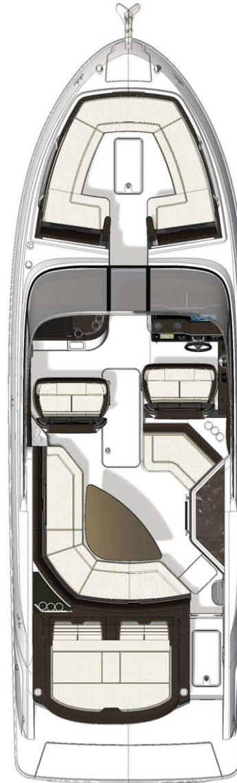
STANDARD SEATING PLAN