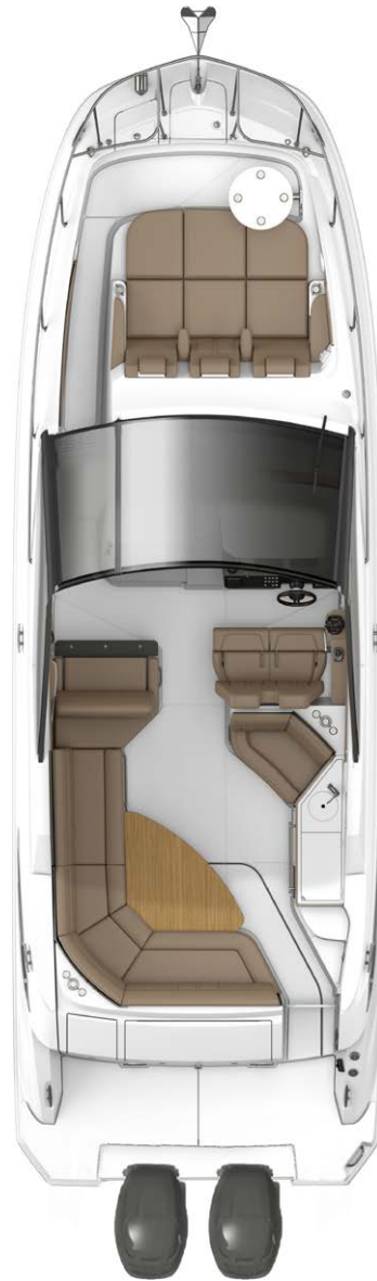
DECK / COCKPIT