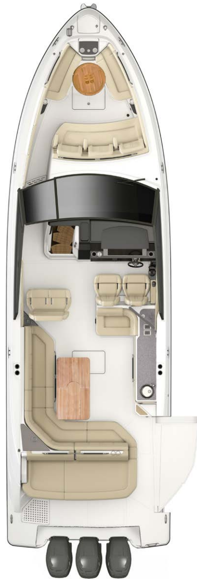
BOW & COCKPIT