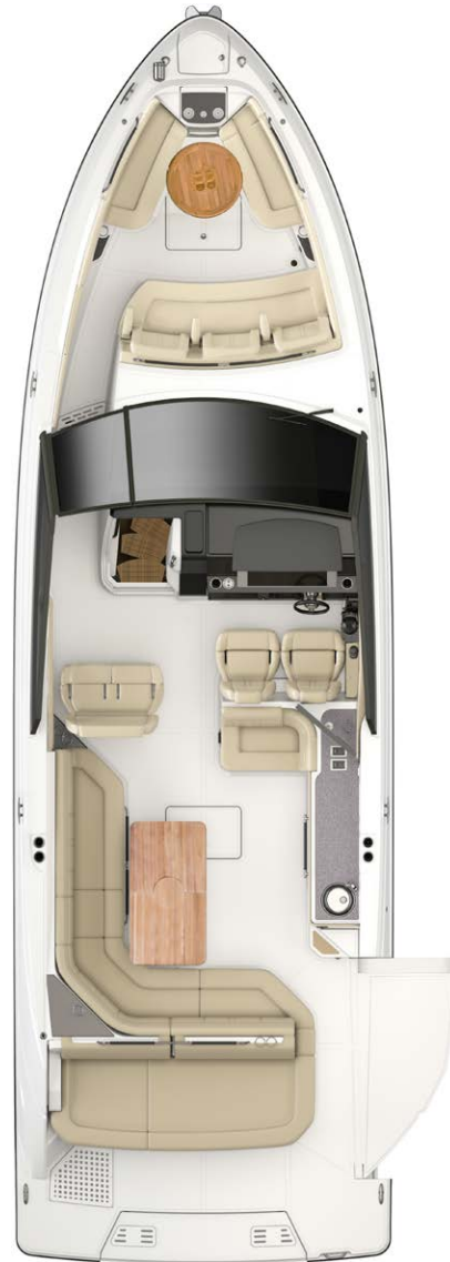
BOW & COCKPIT