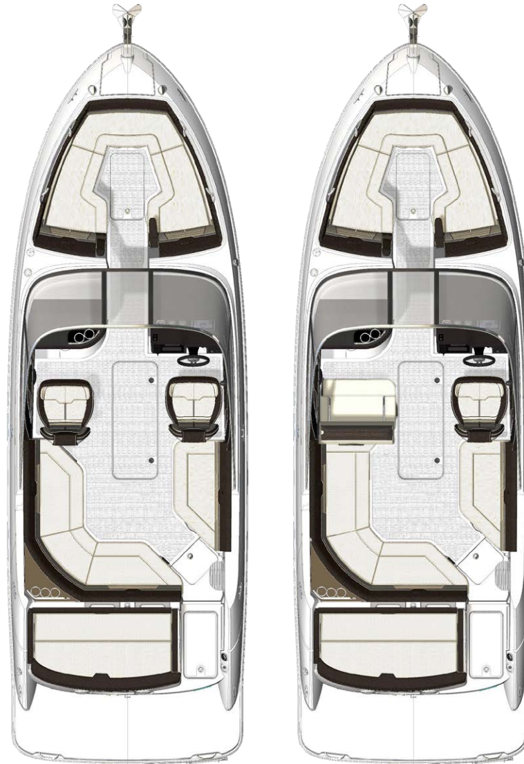
STANDARD TWO BUCKET SEATS