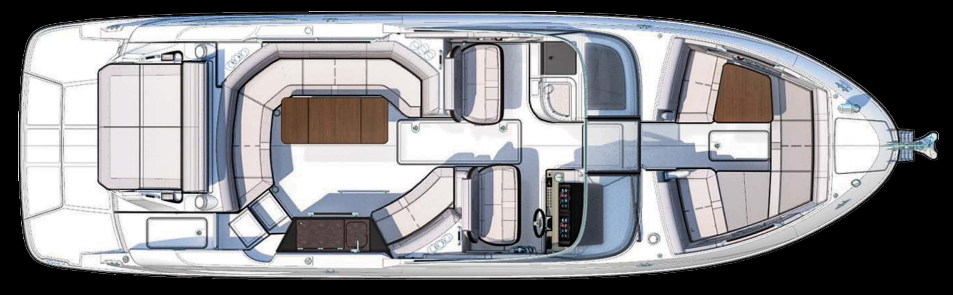
DECK / COCKPIT